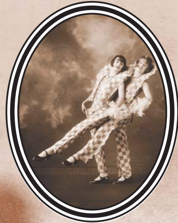
"I think we shall!"