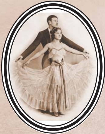
"Shall we go?"